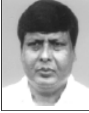
Wazed Ali Choudhury Minister of State, Agriculture (Ind.) Assam