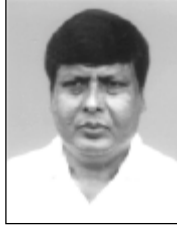
Wazed Ali Choudhury Minister of State , Agriculture (Ind.) Assam